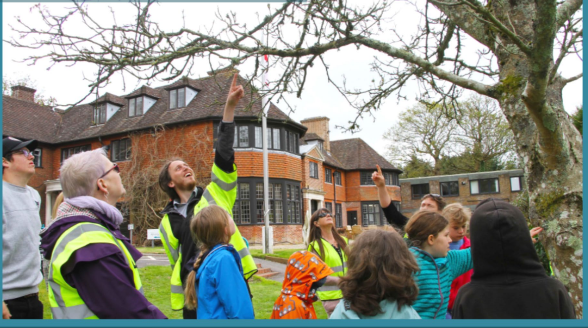
Education day for a local school at Apple Tree Court

The requirement to meet an overzealous standard of inspection can reduce the effectiveness of corporate tree management, reducing the time available to focus on other tree management issues, as set out in The Corporate Tree Strategy.