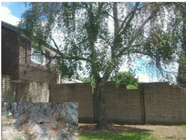
Silver Birch tree deliberately poisoned and had to be removed.

The NFDC's tree stock is a valuable resource and needs to be allocated its recognised industry asset value and managed, not just in relation to risk, but also more widely in terms of maximising the benefits related to trees, and the long-term viability of the tree resource. Risk management must form an integral part of a wider process of strategic tree management.