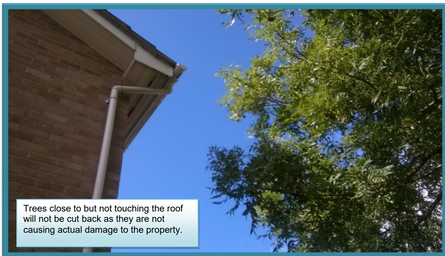
Trees close to but not touching the roof will not be cut back as they are not causing actual damage to the property.

Despite this low risk, the law requires that the risks from trees are managed in a reasonably practicable manner.